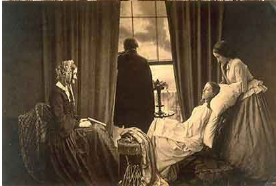
HENRY PEACH ROBINSON, 'FADING AWAY', 1858.

A COMBINATION PHOTO CONSISTING OF 30 NEGATIVES