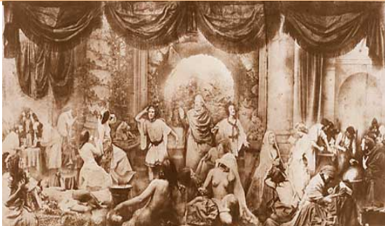
OSCAR REJLANDER, 'TWO WAYS OF LIFE', 1857

A COMBINATION PHOTO CONSISTING OF 30 NEGATIVES