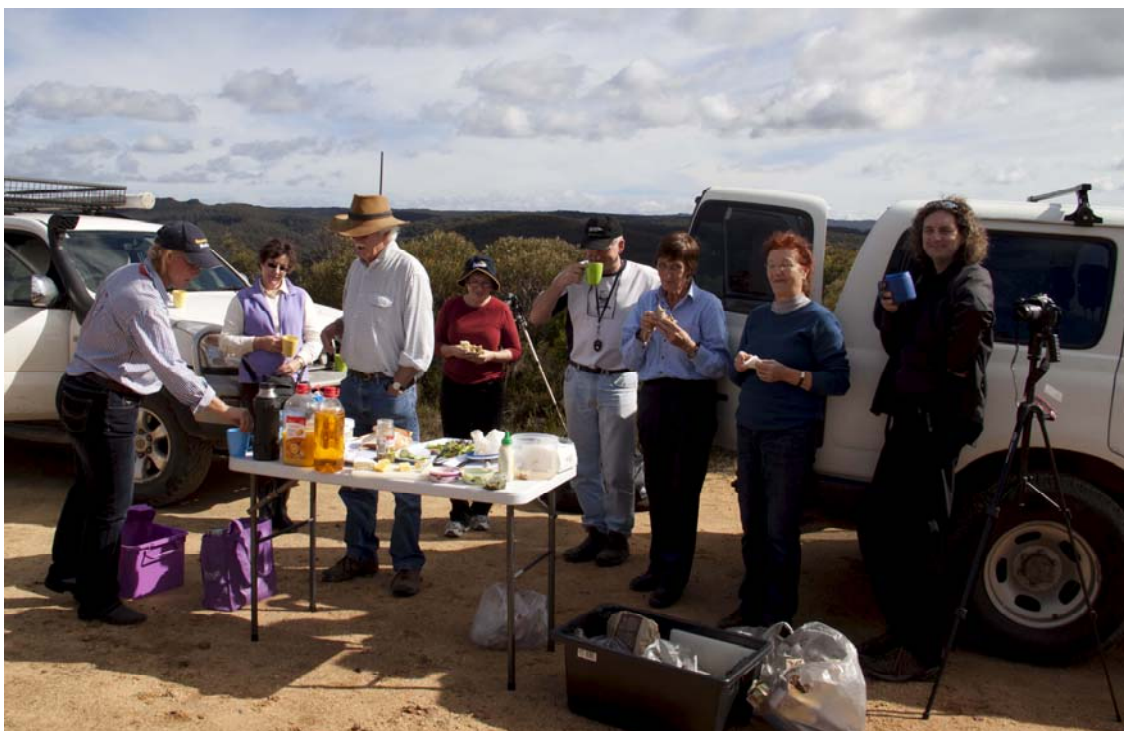
THE BLUE MOUNTAINS WORKSHOP GROUP